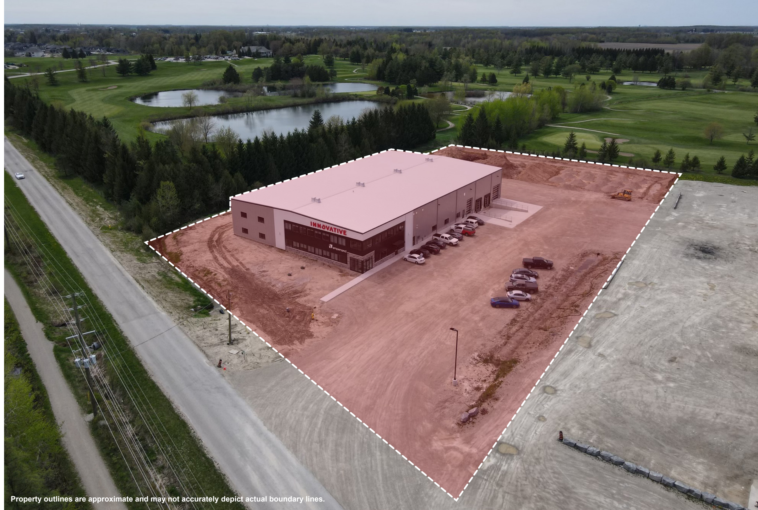
Property outlines are approximate and may not accurately depict actual boundary lines.