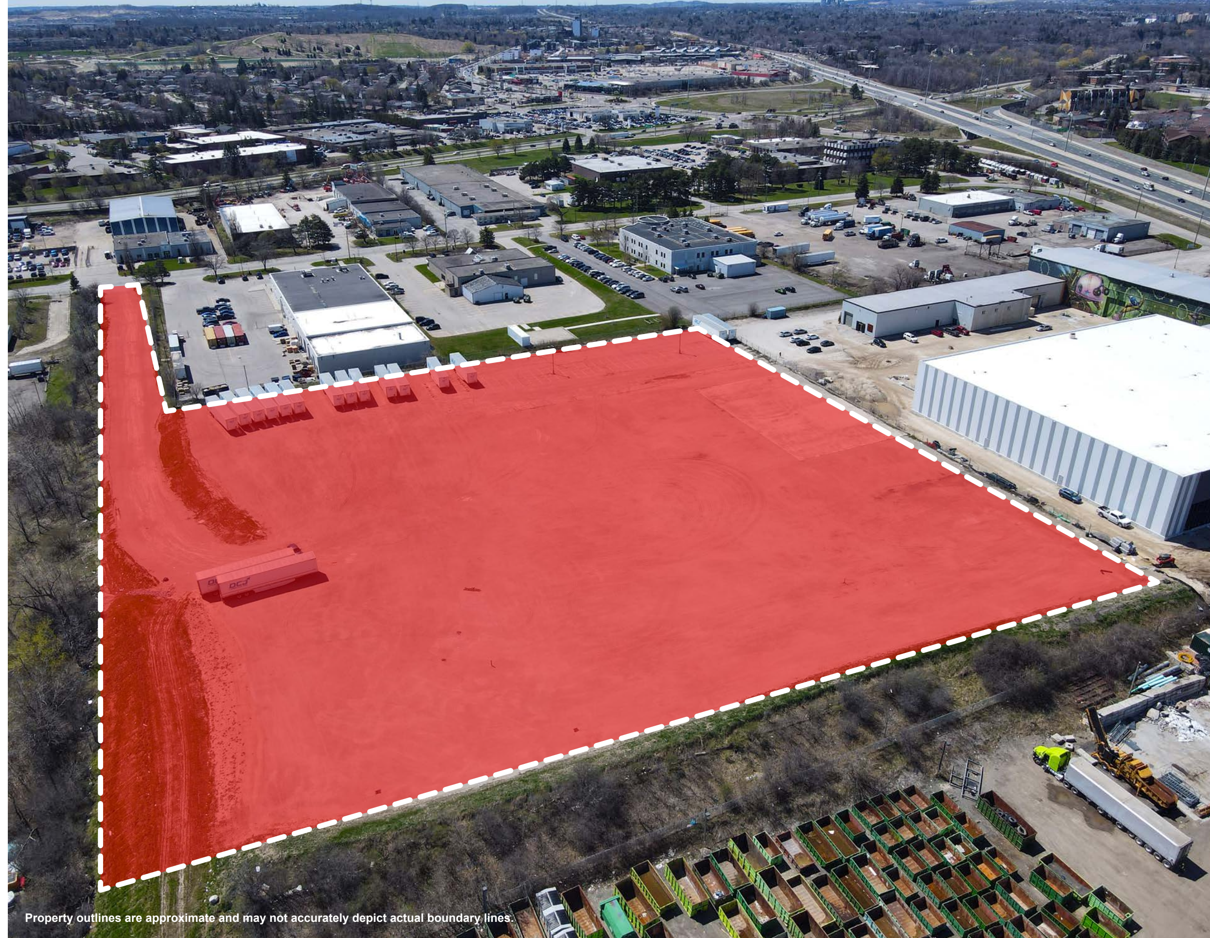
Property outlines are approximate and may not accurately depict actual boundary lines.