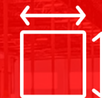
1,300 SF Clear Span Space