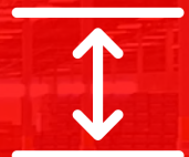
15' Clear Height