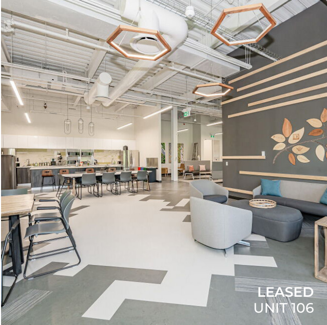
LEASED UNIT 106