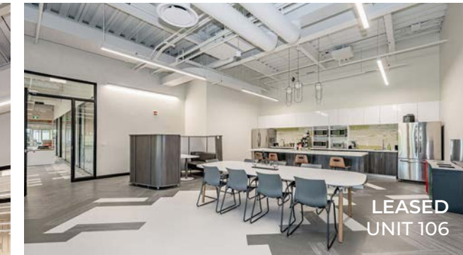
LEASED UNIT 106