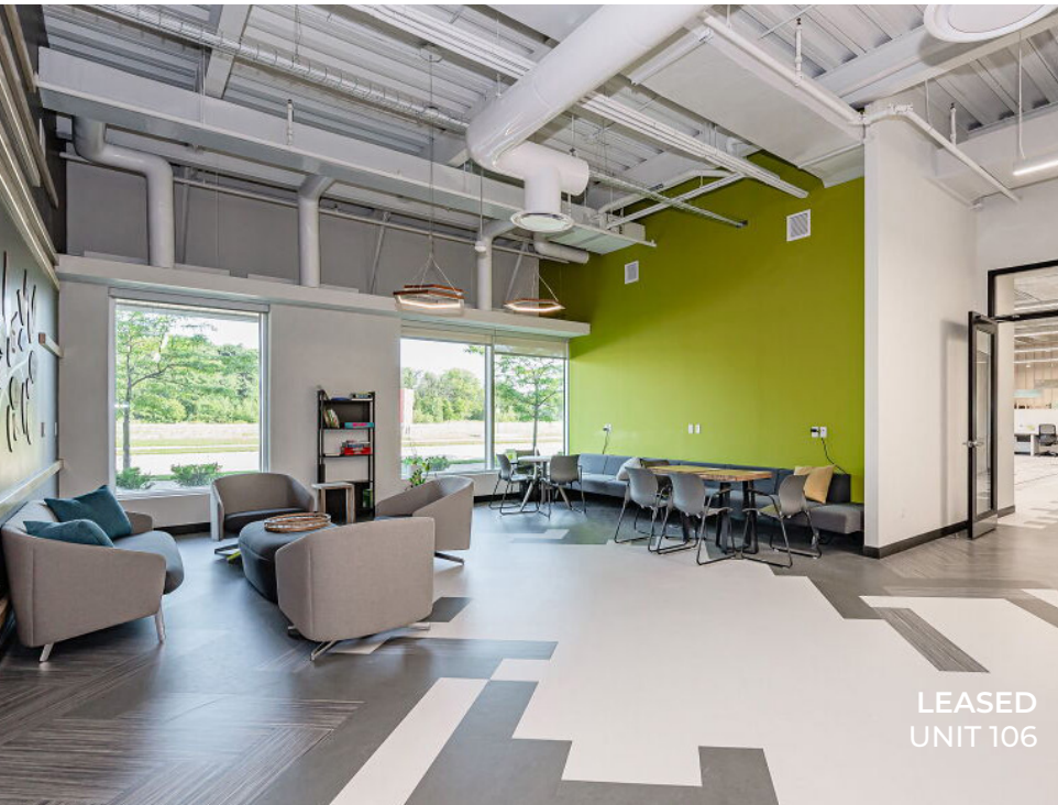
LEASED UNIT 106