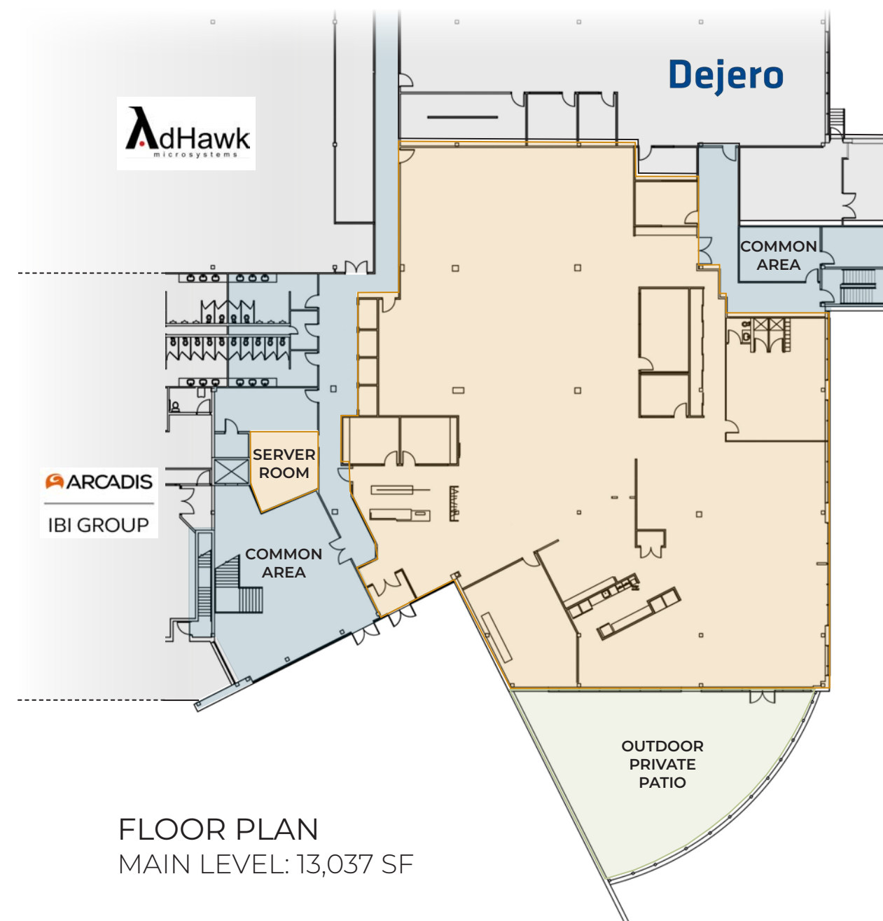
FLOOR PLAN MAIN LEVEL: 13,037 SF

Located in the Waterloo Technology Campus, this 13,037 SF fully built-out space is the perfect size and cost for a growing company. Features include a large kitchen and private outdoor patio area, fitness room and change area, meeting rooms, boardroom and open office environments. Large windows flood the space with natural light. There is also on-site property management, abundant parking and signage available.