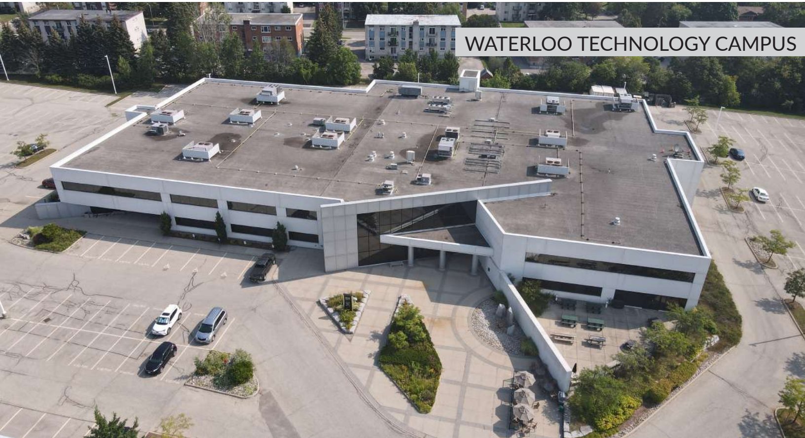
WATERLOO TECHNOLOGY CAMPUS

Built out office space with large kitchen & eating area and patio space. Fitness room, meeting rooms, IT room, boardroom and larger open office environments. Part of the Waterloo Technology Campus with other Tenants - Sandvine, Dejero, IBI and TD Bank. Onsite parking is 4 spots / 1,000 SF. Onsite property manager. Signage available.